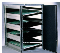
Panels may be installed in Camfil Glide/Pack for side access applications.

CamCarb PC panels available. Contact factory.